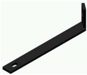
1500/2500/3500 Front Brace